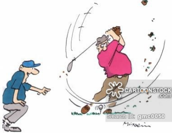
"It moved that time Wally - It definitely moved!"